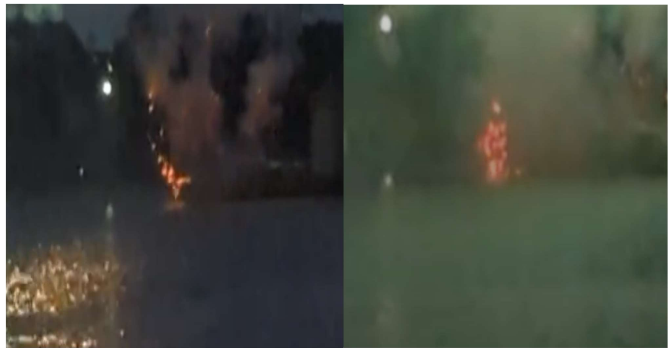
Images 4 & 5: Taken by a CERF representative on September 2, 2024 at the SeaWorld show. Displays burning debris entering Mission Bay.

The Thermal Plan prohibits discharges into Mission Bay that exceed the ambient water temperature by 20°F. SeaWorld's fireworks routinely violate this standard, with dangerously hot debris entering the bay at hundreds of degrees Fahrenheit.<sup>52</sup> This occurs when (1) malfunctioning fireworks fall into the water before completing combustion and (2) hot particulates from the lift mechanism are released after ignition ( see Figures 4 and 5).<sup>53</sup> Fireworks are solid waste as defined by the Thermal Plan, that SeaWorld routinely discharges into Mission Bay. During the shows, burning material can be seen depositing into Mission Bay ( see Figures 4 and 5). Additionally, as discussed in Section 2.1.2, infra , SeaWorld fails to secure the wires and ignitors to the barge and these also discharge into Mission Bay while burning. SeaWorld discharges waste that exceeds Mission Bay's ambient water temperature by 20°F in violation of the Thermal Plan and Discharge Prohibition 4.2.