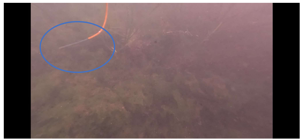
Image 1: Taken by a CERF representative on October 6, 2024. Shows a wire found stripped of its protective layer on the seafloor near the barge.