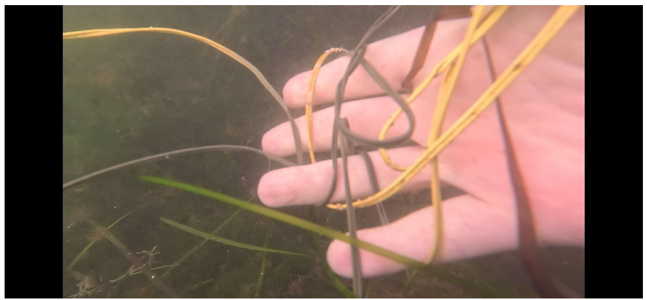
Image 5: Taken by a CERF representative on October 6, 2024. Shows wires grabbed from within seagrass near the barge.

On October 6, 2024, CERF members conducted a dive beneath and around the fireworks barge to observe the condition of Mission Bay's seafloor. The dive team found numerous lengthy, spiky wires, foil, shattered plastic ignitors, and cross matches with sharp ends littering the sensitive seagrass below the barge ( see Figures 1 above and 5 below). In fact, the seafloor of the entire observed area near the barge was strewn with copious debris. The sheer amount of submerged fireworks waste indicates (1) SeaWorld has failed and continues to fail to send a dive team to collect settled debris<sup>74</sup> and (2) SeaWorld has failed and continues to fail to secure wires and other components to the barge specifically intended to prevent this type of discharge.<sup>75</sup> Thus, SeaWorld has violated and continues to violate 2023 FBMPP Section 3.c., 2022 Fireworks Permit Section 5.2.1.6, and 2011 Fireworks Permit Section V.4.